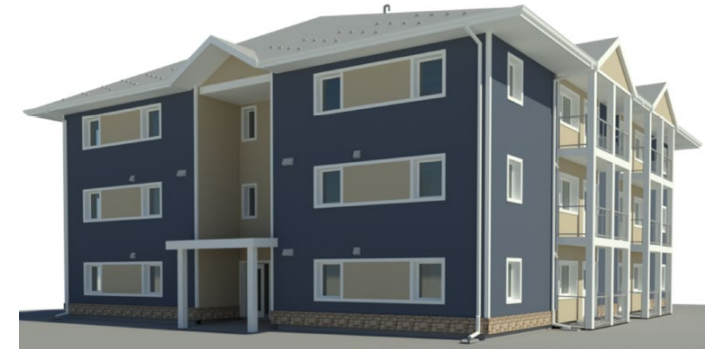
Phase 1: Petawawa, ON