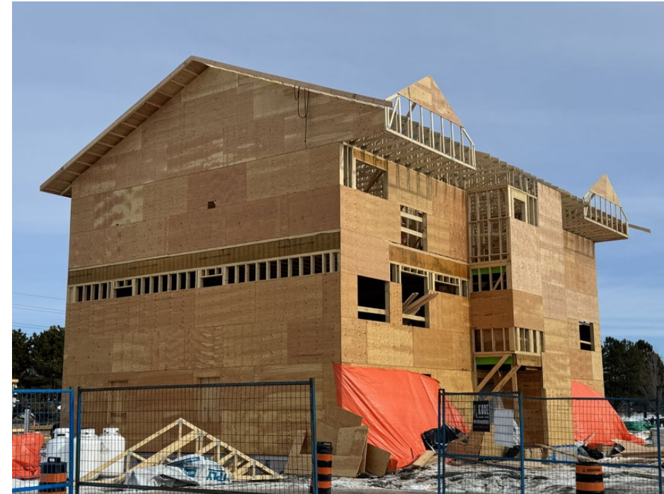
Phase 1: Kingston, ON