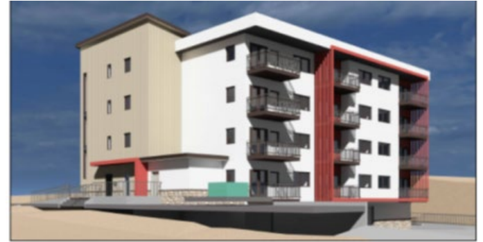
Phase 1: Esquimalt, BC