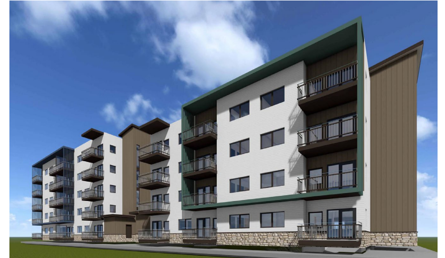
Phase 1: Esquimalt, BC